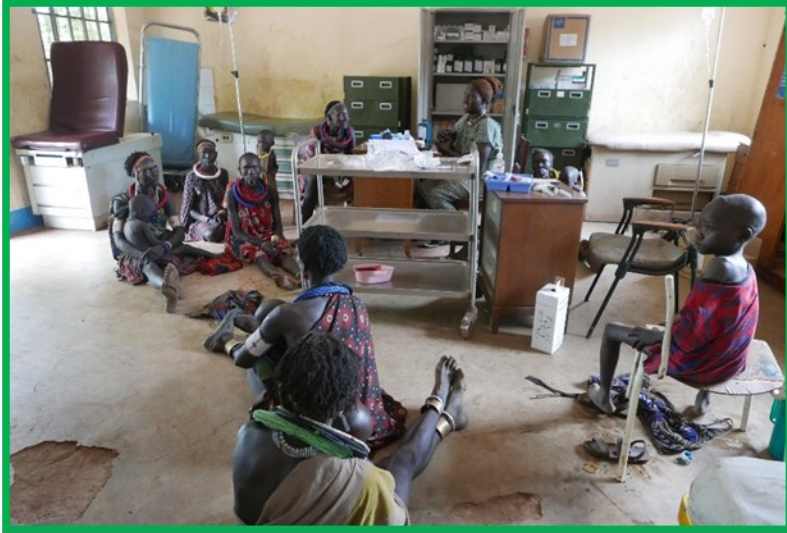
Above: Maternal & Child Health Education Session at PHCC

All the staff at the Health Centre took interest in my problem. They checked me good. They told me we have to go to a far away place to get the right care. I agreed but I had no energy to resist. All the people of my village thought they would not see me again because they knew that this situation means the mother and child will die. They had seen it so many times before. Many of our mothers die. When I left, they thought it was the last time to see me.