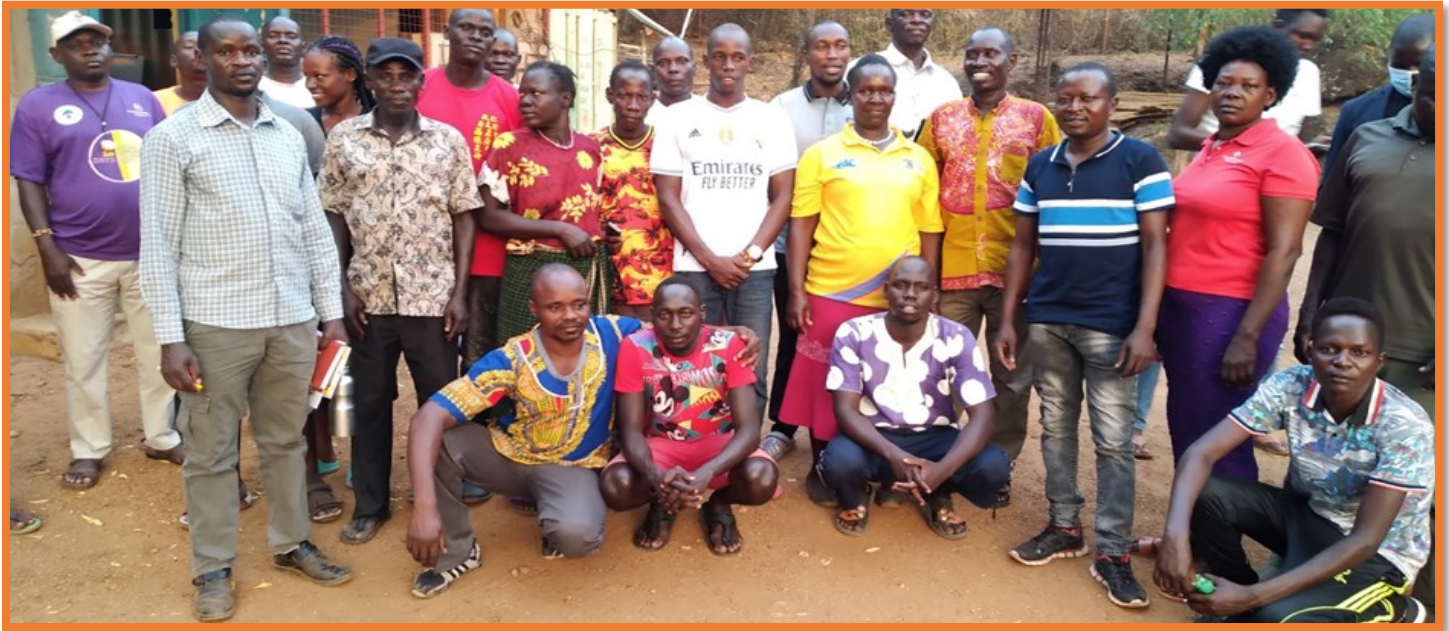
Holy Trinity Peace Village Kuron Staff at Annual General Meeting and Capacity Building.